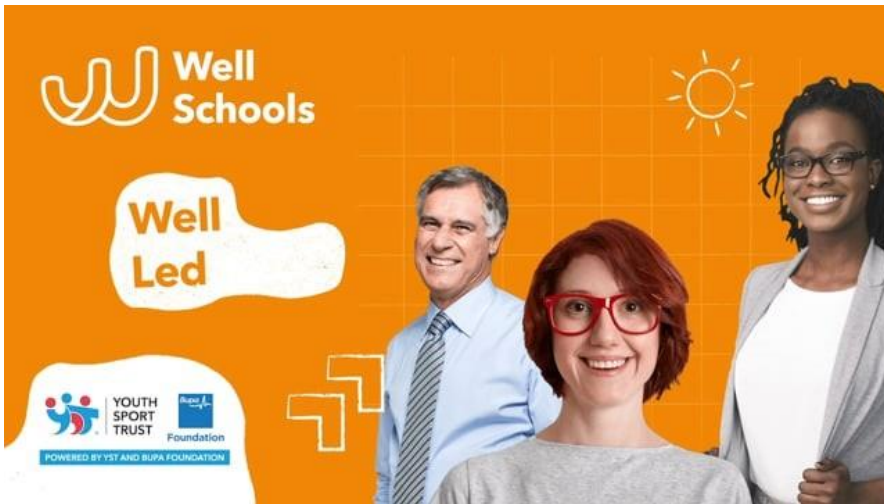
Well Schools — leading in a crisis on Vimeo

“Great leaders don't see themselves as great; they see themselves as human.” (Simon Sinek)